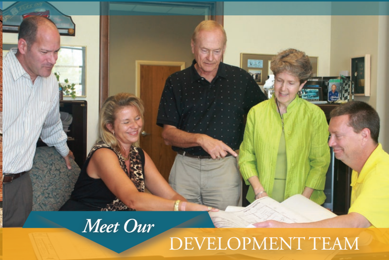
Meet Our DEVELOPMENT TEAM