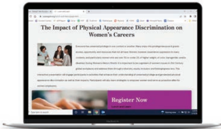
One example of UCP Seguin's nascent Lunch & Learn series of conversations to promote an inclusive environment at UCP Seguin.