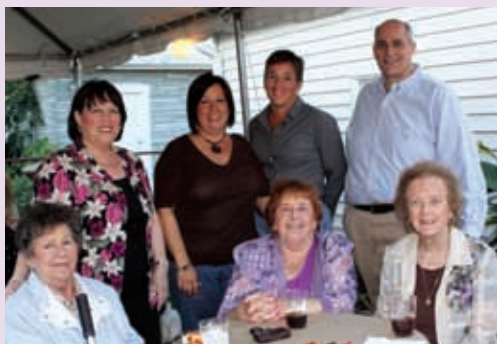
The Gibilterra Family