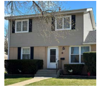
The ladies’ home in Broadview.

community, and dedicated live-in staff to provide around-the-clock care and companionship. They’re able to attend school and maintain relationships with biological families when able.