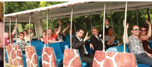
Seguin's Gala guests enjoy a pleasant tour of the animal habitats in the zoo's trolley.