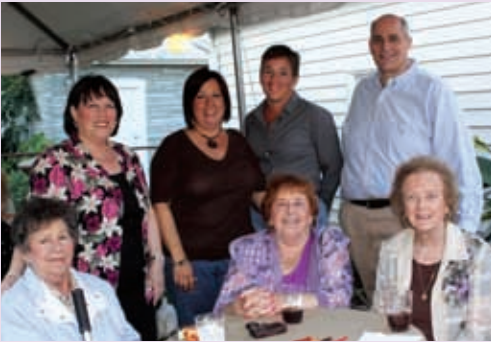
The Gibilterra Family